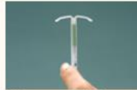
Hormonal IUD Mirena, Skyla & Liletta